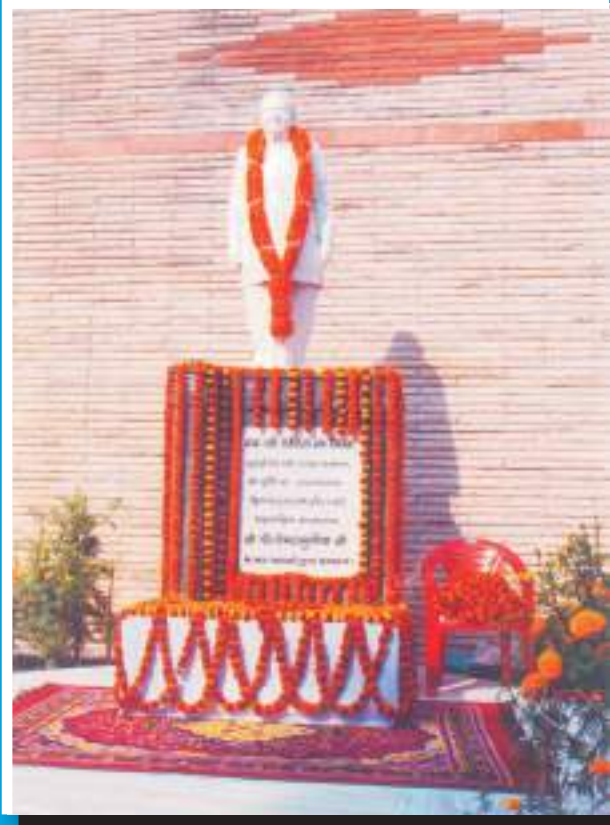
LATE LALIT NARAYAN MISHRA

The administration of the Institute reserves the right to change the requirements for admission, make additions in the foregoing enumeration of course fees charged, the regulations affecting the students, or to make other suitable modifications if these are deemed necessary.