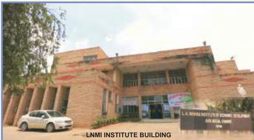
LNMI INSTITUTE BUILDING