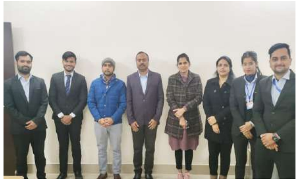
HDB Financial Services