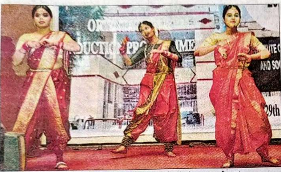
ललित नारायण मिश्र संस्थान में शुळवार को अनुकूलन सह अधिष्ठापन कार्यक्रम के दौरान नृत्य करती छात्राएं। एलएनएमआई में नए बैच का स्वागत