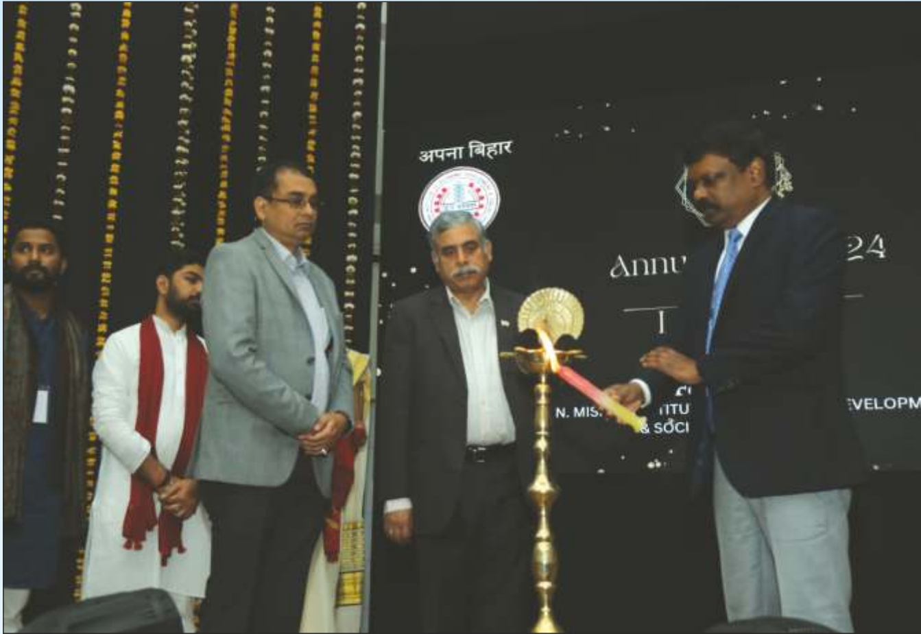
Director and Distinguished Guest from IIM Lucknow on Annual Day-2024