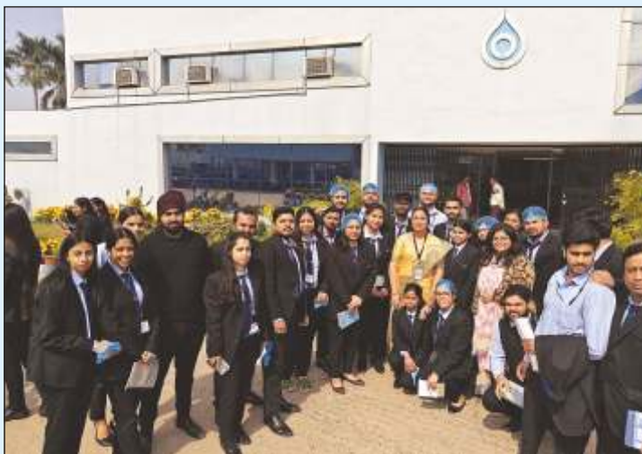
Industrial visit at Patna Dairy