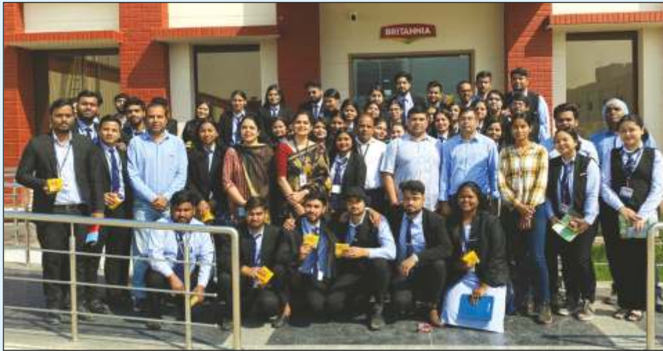
Industrial visit at Britannia