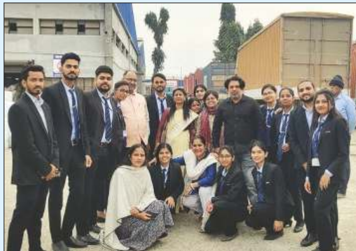
Industrial Visit At Bela Cluster Bag & Textile Industries, Muzaffarpur