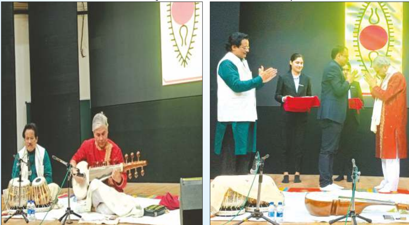
Spic Macay Programme in Auditorium